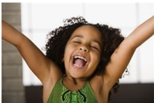
SPARK is a 12-week program