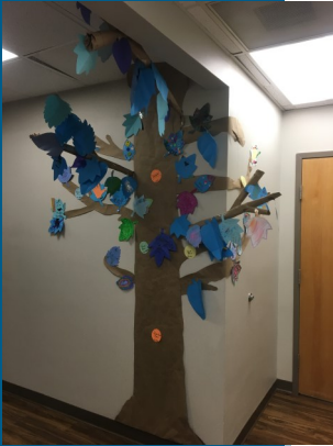
Create a Blue Ribbon Tree at school

Everyone has the power to make a difference in the life of a child. Choose to be the difference and Build a Blue Ribbon Tree with the rest of Northern Kentucky.